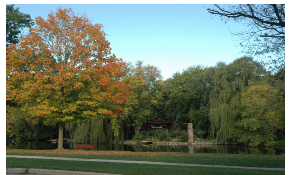
Division Street Park

Viking Motorcars Kevin Doerr 817 W. Main Street Stoughton, WI 53589 608-205-6555