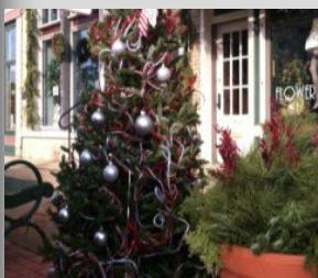
This tree decorated the sidewalk in front of Stoughton Floral for this year's Victorian Holiday Celebration.