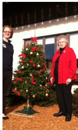
The Senior Center's tree took top prize for best decorated tree.

For the latest real estate statistics, click HERE.