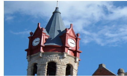
Stoughton's Clock Tower