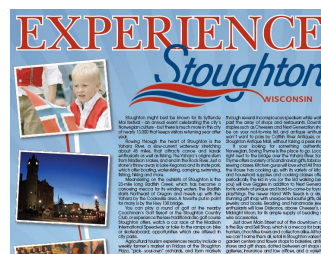
2011-2012 Visitor’s Guide